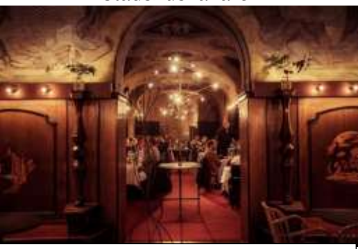
Welcoming dinner, 18h-20h30

Stockholms Stadshus Hantverkargatan 1, 105 35 Stockholm