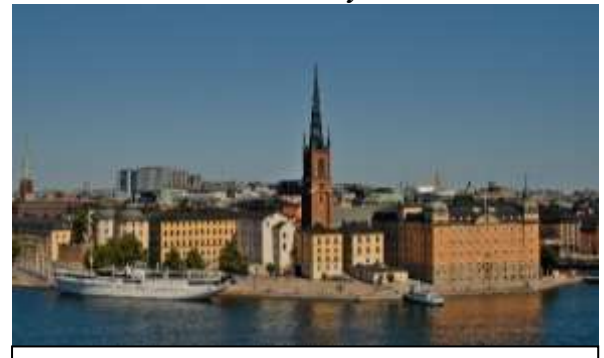
City tour, 16-17h

Visit to the historical landmarks of Stockholm's old town, which dates back to the 17th and 18th centuries.