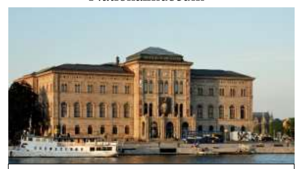
Visit to the Timeline exhibition, 16-17h

Södra Blasieholmshamnen 2, 111 48 Stockholm